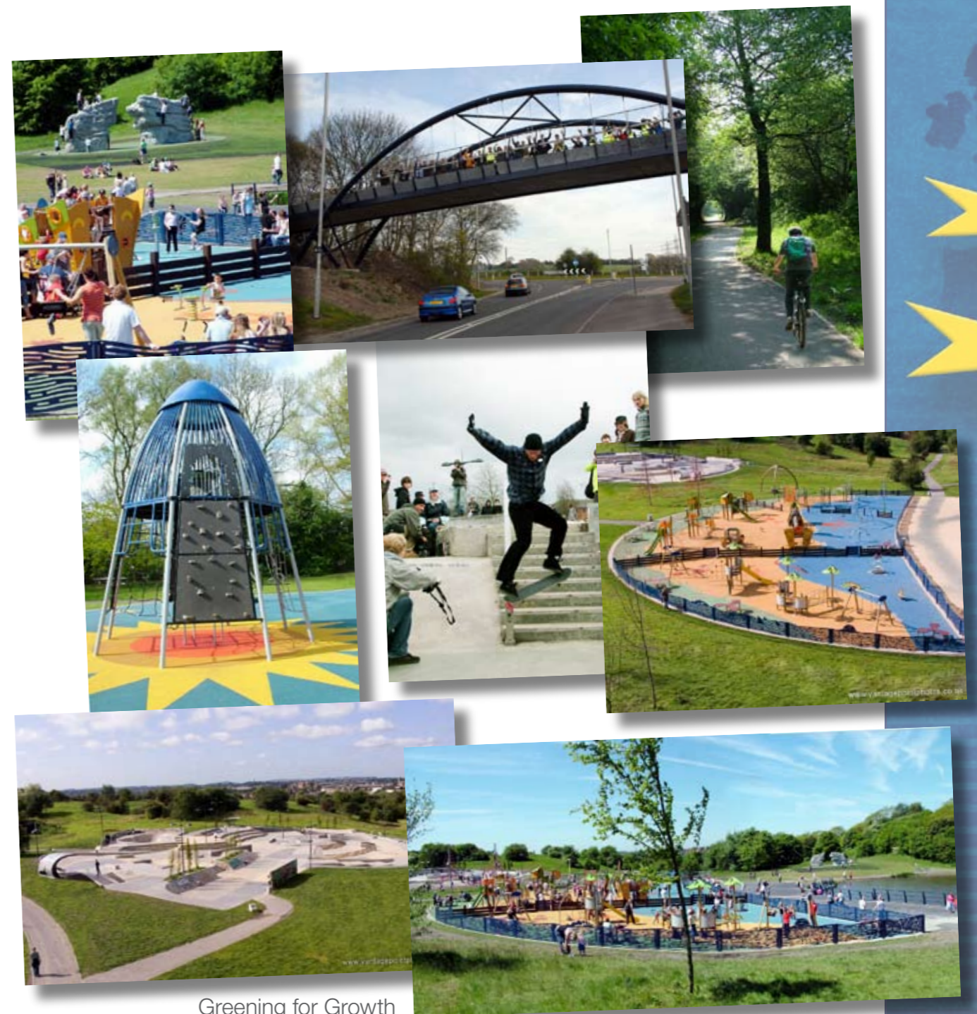
Greening for Growth